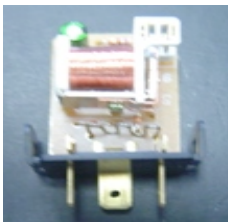
< BEFORE-OPEN SYSTEM >