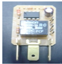
< AFTER-SEALED SYSTEM >